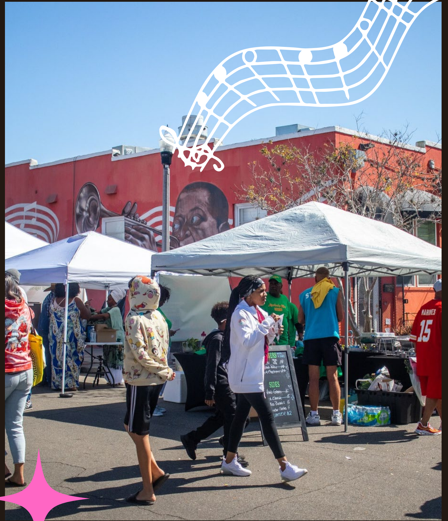
Tampa Bay Collard Green Festival, Deuces Live 2023